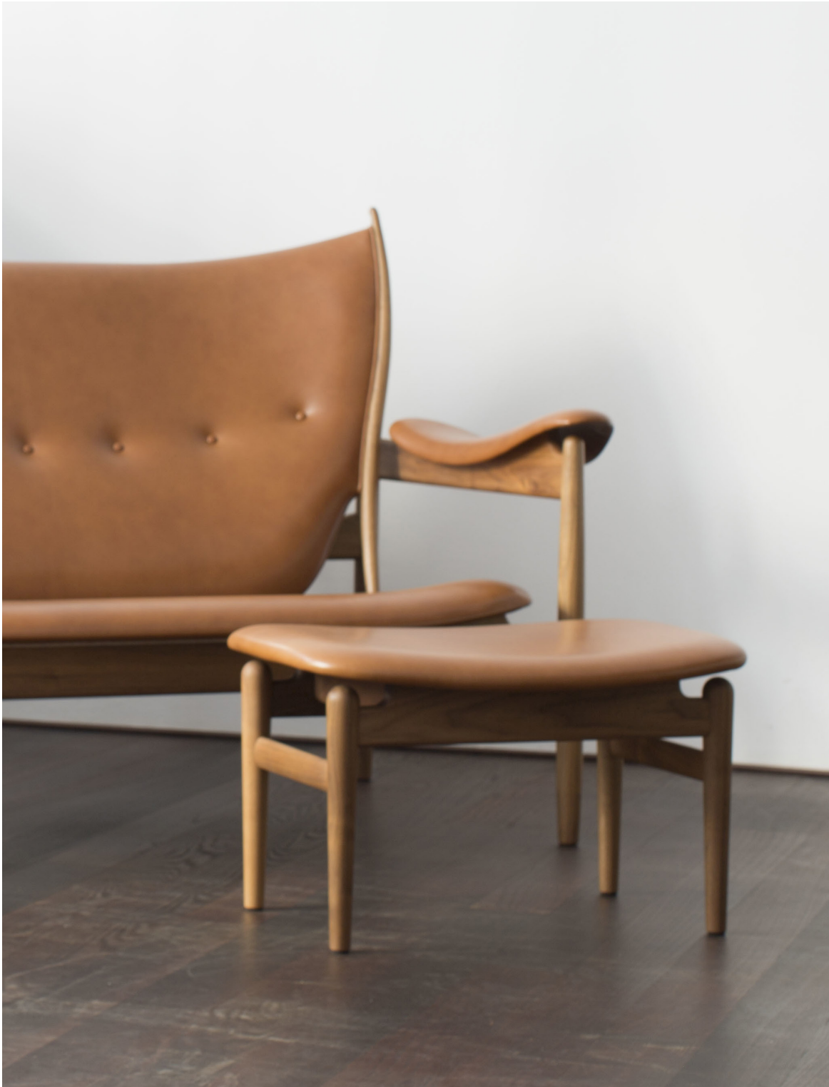
CHIEFTAIN FOOTSTOOL 1953 BY FINN JUHL